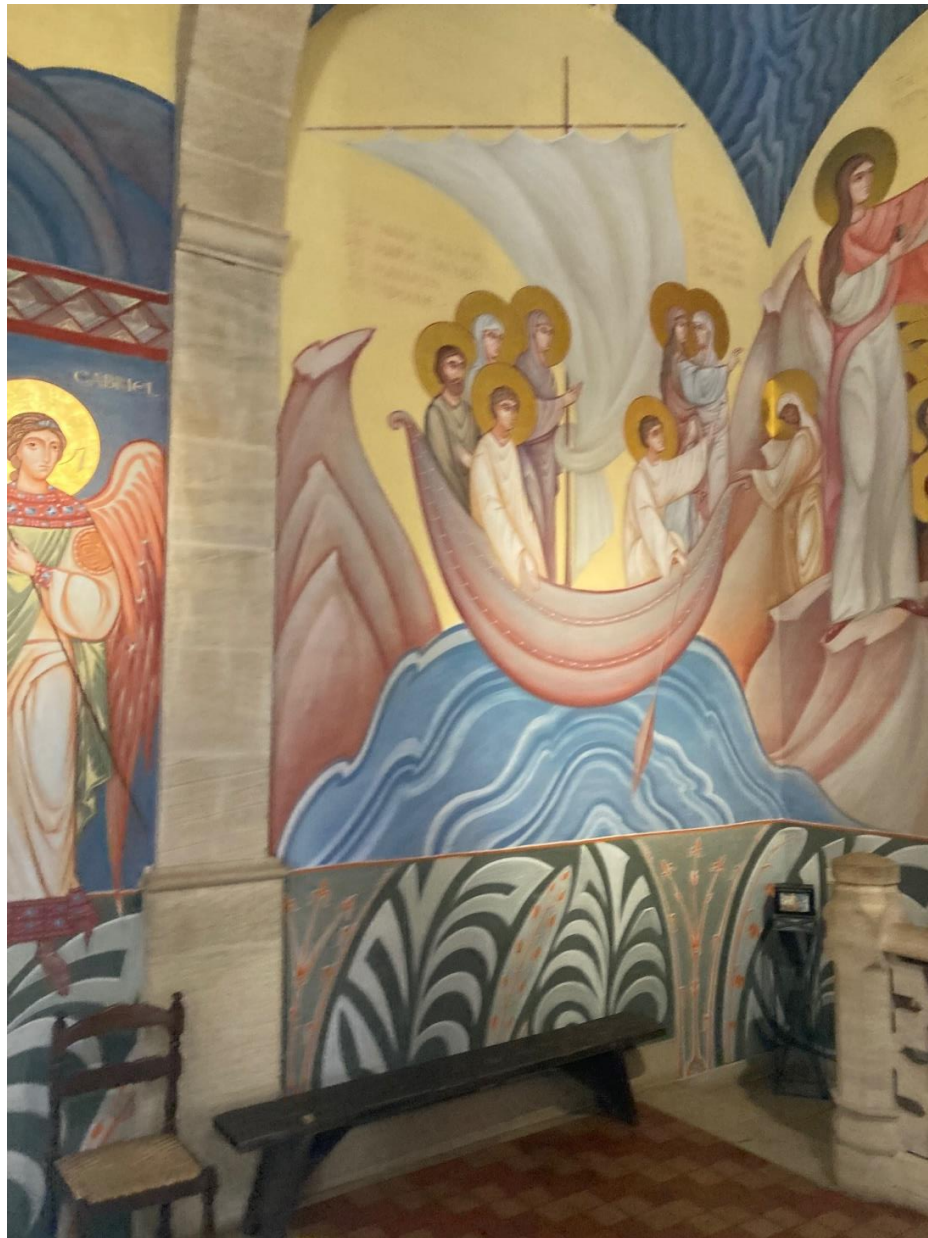
from a French orthodox Church Retreat near Lorgues, France